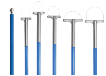
Disposable LLETZ/LEEP Loop and Ball Electrodes †