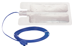
Split Disposable Return Electrode with cord †