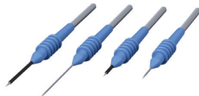
Disposable SuperCut™ Needles Electrodes †