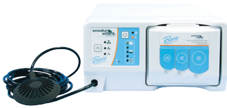
SE02 Smoke Evacuator †